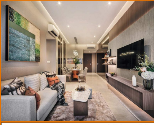
4 - Bedroom + Study